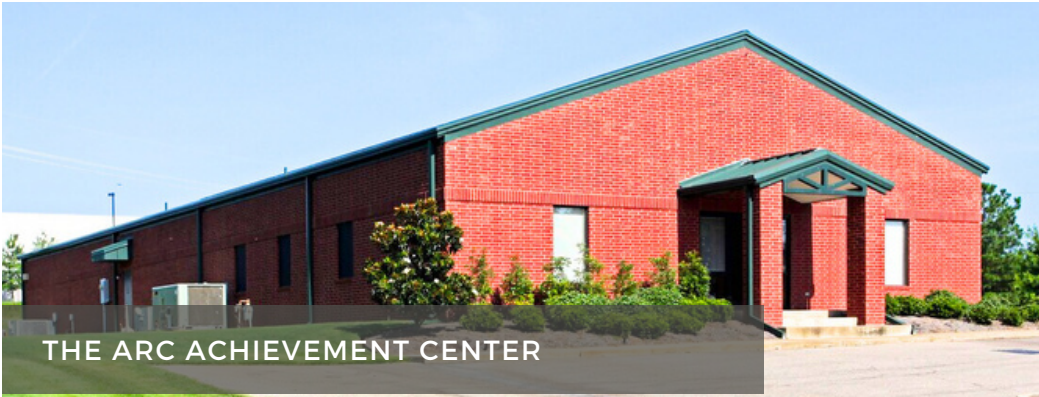
THE ARC ACHIEVEMENT CENTER